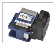
Table-top cleaver FC-6+ series