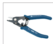
Jacket remover JR-M03