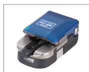
Handy cleaver FC-8R series