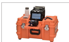
Carrying case with worktable CC-B2