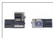
Pitch changing holder PCH-12A