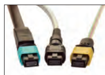
Available for Lynx-Custom Fit™ Splice-On Connector