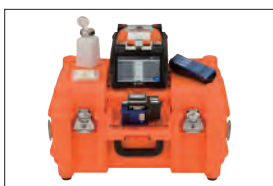
Carrying case with worktable CC-82