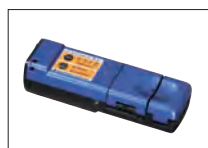
Hot jacket remover JR-6+